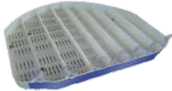
Injection molded plastic shelf with built in gliding surface