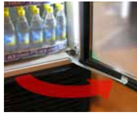
Hold open for the door also locks the RotoShelf in display position