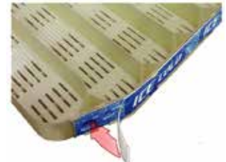
Integrated label holder